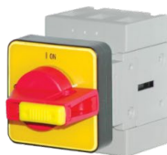
▣= 48x48mm yellow plate with red, 1-padlock handle