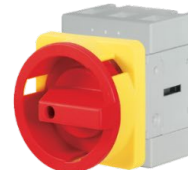
▣▣= 64x64mm yellow plate with red 3-padlock handle