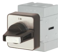
= 48x48mm silver plate with black, 1-padlock handle