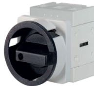
□ = 64x64mm silver plate with black 3-padlock handle